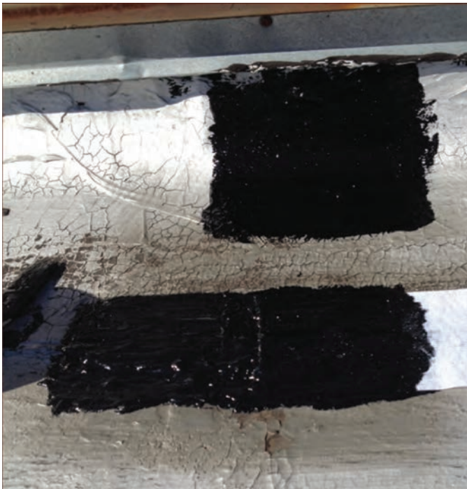
Karna-Flex 3-course repair on asphalt BUR with aged aluminum coating.