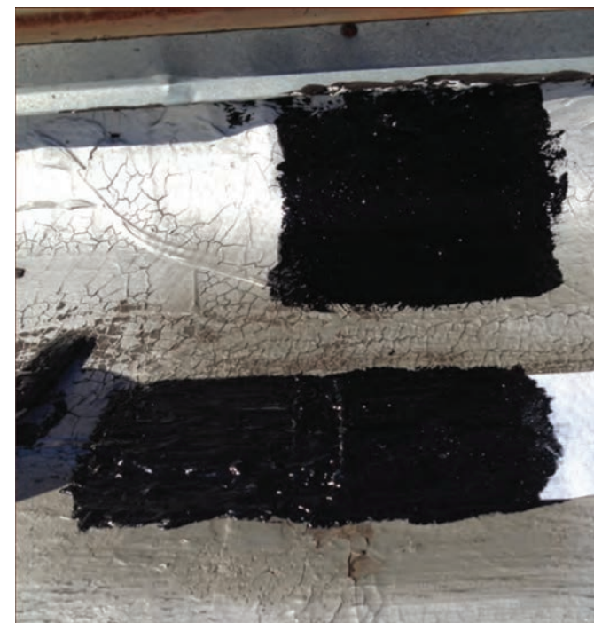
Karna-Flex 3-course repair on asphalt BUR with aged aluminum coating.