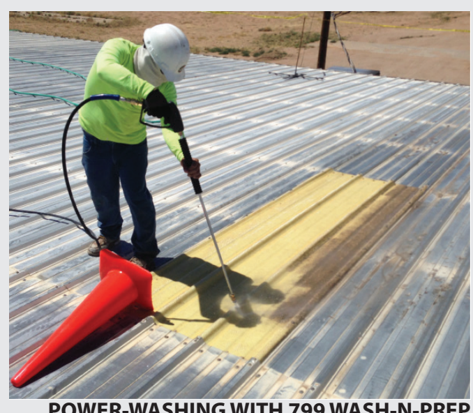
POWER-WASHING WITH 799 WASH-N-PREP

Apply two coats of #45 Sky-Kote to the skylight surface at the rate of 1.5 gallons per 100 sq. ft. per coat. Depending on the irregularity of the surface additional coats may be required to achieve a smooth surface.